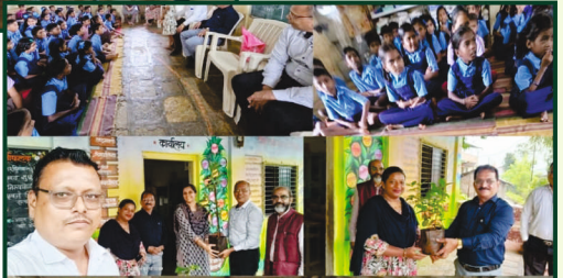
Tree plantation at Asole Village